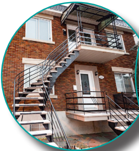
1862, Jolicoeur street, Montreal