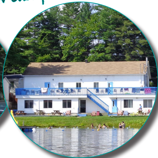
Domaine du Lac Bleu at St-Hippolyte